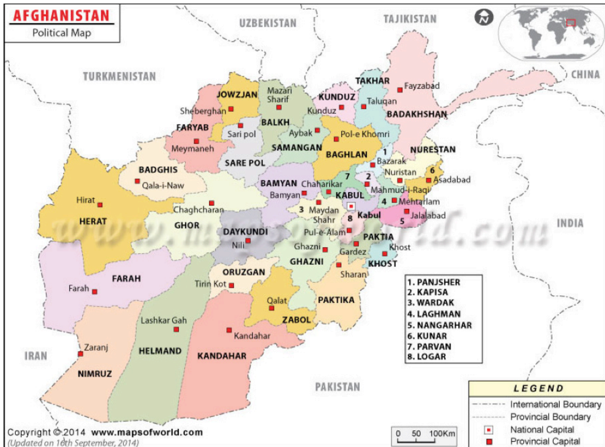
Figure 1: Map of Afghanistan